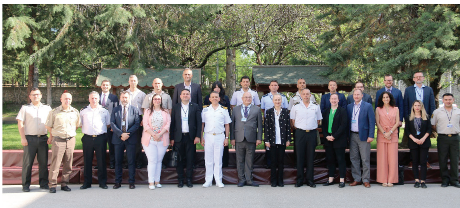
A group photo taken during the “Border Security in Contested Environment Workshop” organized by COE DAT in Ankara in June 2023.

Since the end of the Cold War, the world experienced many changes including the collapse of the Soviet system and the rise of Russian Federation as a regional power; establishment of new nation-states in Eurasia; the establishment of the European Union and the Schengen Area and Eurozone -and hence the introduction of Euro as a rival currency to US Dollar-; several wars in the Balkans; the 9/11 attacks and the ensuing War Against Terrorism; invasions of Afghanistan and Iraq; the rise of different kinds of terrorist threats; Globalization and its effects on all the world states and all world economic balances; the rise of People’s Republic of China as a totalitarian state that applies liberal economic ideas; and, the new ease of movement for people, workforce, financial products, capital, technology, and ideas.