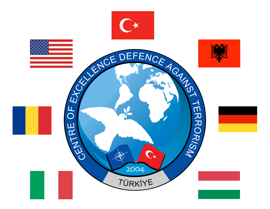
Peace at Home, Peace in the World"